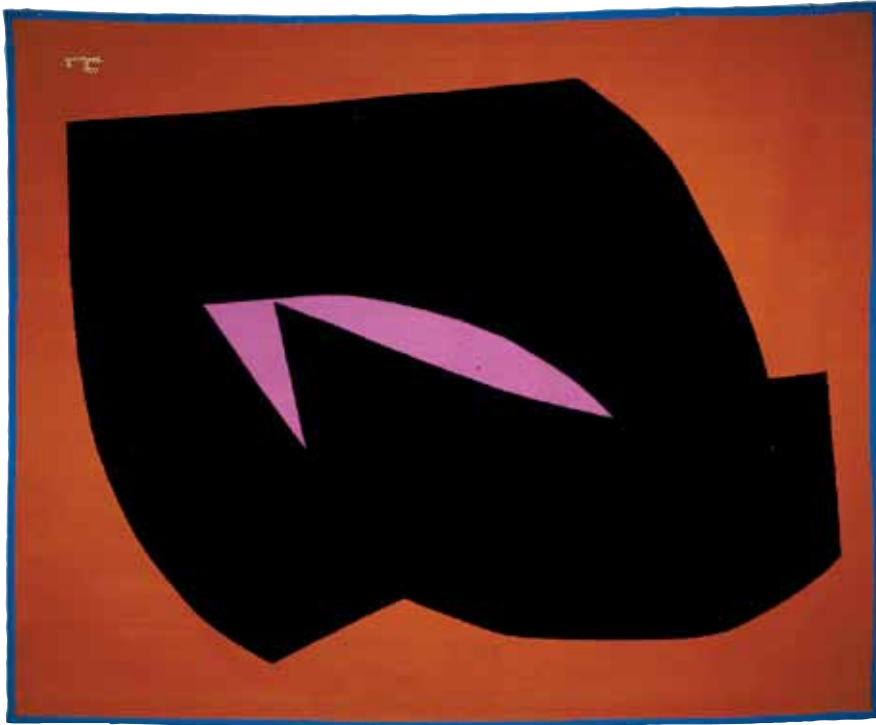
"Black Diamond," 1977. Wool, 7 by 9 feet.