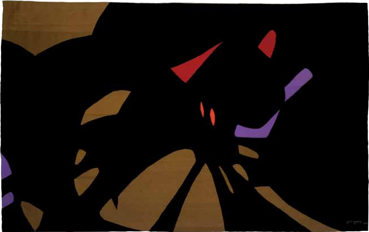
"Eruption," 1973. Wool, 8 by 11 feet.